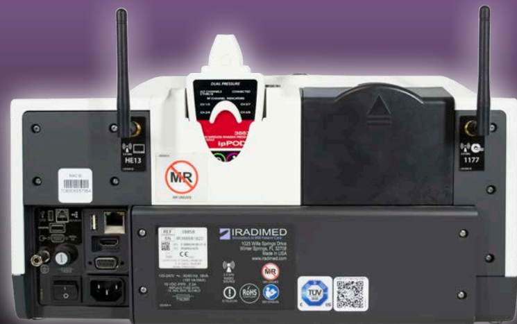
Reverse side of 3885B