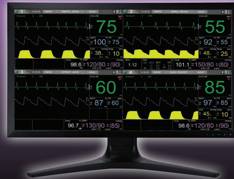
Remote monitoring 4 patients on 1 screen