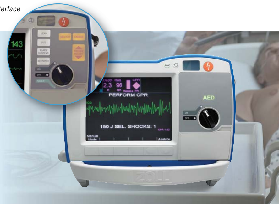
Manual interface activated

The unique OneStep Pediatric CPR electrodes also provide visual feedback by displaying the rate and depth of every compression on the CPR Dashboard. These electrodes are specifically designed to ensure precise CPR measurements in small children.