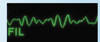
Signal filtered by See-Thru CPR