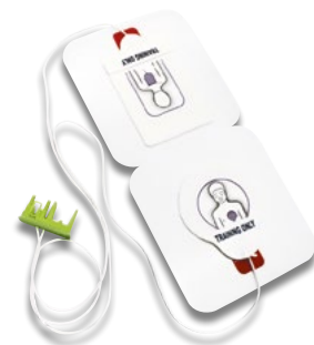
Pedi-padz® II Trainer Electrodes Part# 8900-000861-01 (case of 6)