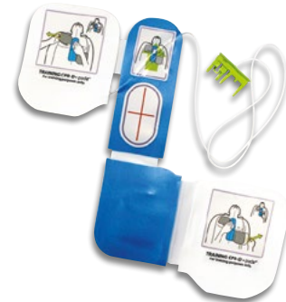
CPR-D-padz Trainer Electrodes Part# 8900-0804-01