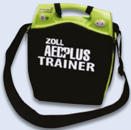
AED Plus Trainer Carry Case Part# 8000-0375-01