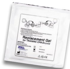
Replacement Adhesive Gels for CPR-D-padz Trainer Electrodes Part# 8900-0803-01

(Replacements must be ordered separately)