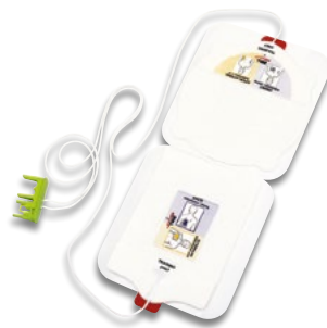
Stat-padz® II Trainer Electrodes Part# 8900-0805-01 (case of 6)