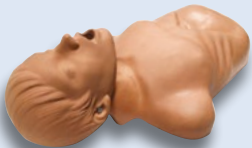
AED Plus Trainer Demo Manikin Part# 8000-0835-01