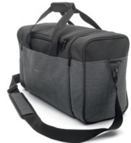
Trilogy Evo travel bag (1134428)