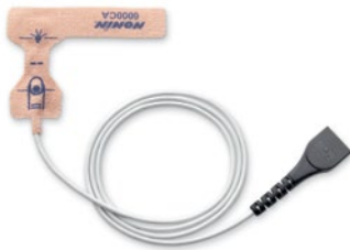
Pulse oximeter sensor, adult (1070692)