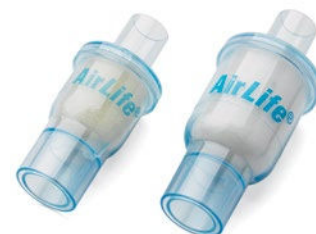
Airlife, pediatric (C06273) Airlife, adult (C06274)