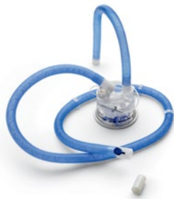
RT202 adult single limb heated circuit kit (1141426)