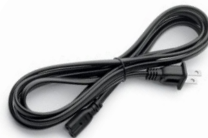
Power cord, straight C7 end - 8ft