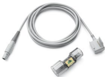
Electronic flow sensor accessory with cable, adult/ped (1132106 )