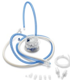
RT265 Fisher & Paykel infant dual limb (1141548)