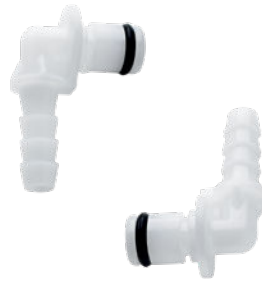
Oxygen inlet adapter (1040390)