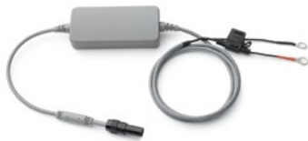
Cable, 12/24V battery with terminals (1127401)