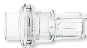
Whisper swivel II (332113)