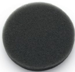
Air Inlet Foam Filter (1134591 10/pack)