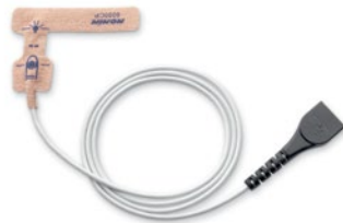
Pulse oximeter sensor, pediatric (1070693)