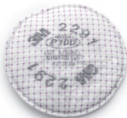
Particulate filter (1134430 10/pack)