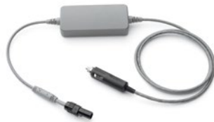
Cable, 12/24V battery with car adaptor (1127402)