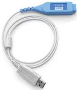
External pulse oximeter (1129640)