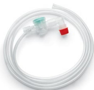
Disposable active exhalation valve (1131661 10/pack)