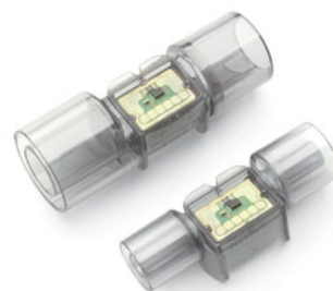
Electronic flow sensor, adult and infant (1134711) (1134712)