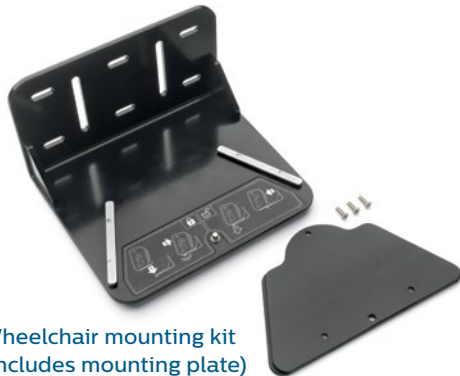
Wheelchair mounting kit (includes mounting plate) (1134633)