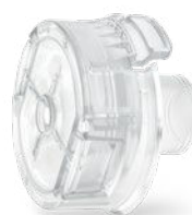
Dual limb AEV (1139436 10/pack)