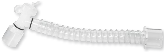
Flexible trach adapter with 22 mm connection (1073902 10/pack) Connects to exhalation ports used with the passive circuit.