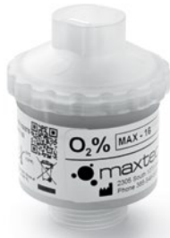
FiO 2 sensor assembly (1134668)