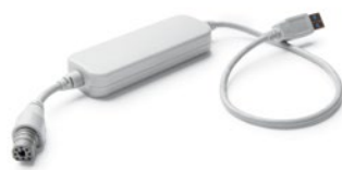
Capnostat USB adaptor (1127404)