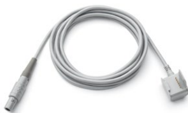
Electronic flow sensor cable (1134592)