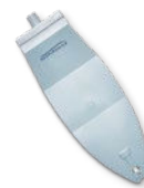
Test lung (1021671)