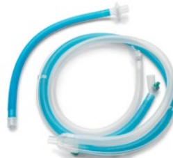
(15mm 1127304)* (22mm 1127303)*