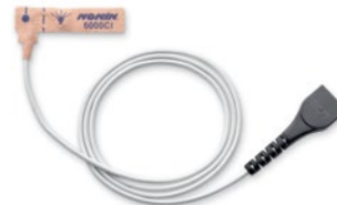
Pulse oximeter sensor, infant (1070694)