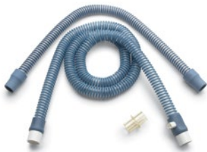
Fisher & Paykel 900MR810 reusable circuit (1141549)