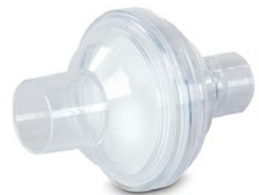
Bacterial filter (342077 10/pack)