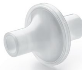
Bacterial/viral filter (1135776 10/pack)