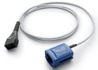
Re-usable adult SpO 2 sensor (Nonin) (936)