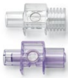
Capnostat airway adaptor (1020709) (1020711)