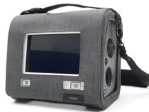
Trilogy Evo in-use case (1133930)