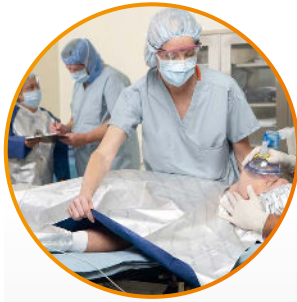
During the perioperative period