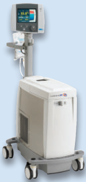
The Thermogard XP® (TGXP) Intravascular Temperature Management System (IVTM™)

Please refer to Catheter Indications for Use reference literature or visit www.zoll.com .